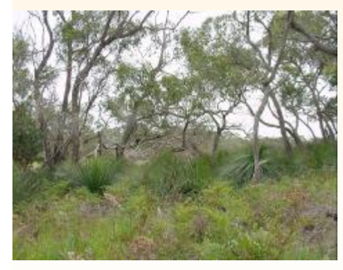
Native vegetation which is ideal habitat for bandicoots

A catchy slogan to catch the eye of passing motorists. A mention of both the Mt Lofty Ranges Southern Brown Bandicoot Recovery Program and it's sponsors, Jensen Planning & Design and The Yurrebilla project A mention or logo of your School.