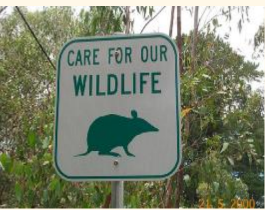
Scott Creek Primary School bandicoot road sign.