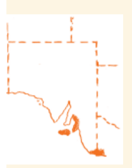
Southern Brown Bandicoot

Distribution: In South Australia the bandicoot is known to occupy areas of the Mt. Lofty Ranges, Kangaroo Island and small area in the South East. These are the last remaining species of bandicoot that is naturally occurring in South Australia. Two species have been re-introduced while all other species have become extinct.