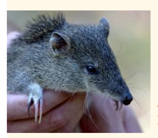
A Southern Brown Bandicoot

want to alert motorists to the presence of bandicoots in the area and stop the number of accidental road kills. Motorists often mistake bandicoots for large rats or rabbits. This can cause a high road kill rate in populated areas such as yours. We would like your class to design a Road Warning Sign to help drivers recognize there are bandicoots crossing the road in your area. Students at Scott Creek Primary School have designed a road sign (pictured below). The class then petitioned their local council to produce the sign to be erected on the road around their local national park. It is now positioned near their school.