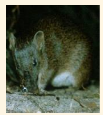
Southern Brown Bandicoot

Description: The Southern Brown Bandicoot has brown fur with distinct golden streaks that cover most of its body. The fur underneath is often dull white or cream colour. The bandicoot is a small and quick marsupial that varies in size and weight. The adult males can grow up to 45 centimeters and adult females 41 centimeters. The average weight for males is around 850 grams and females are around 700 grams. Males are almost always bigger and heavier than the females.